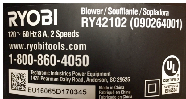
Photo 3: Data Plate located on the bottom of the Ryobi 8amp Jet Fan Blower